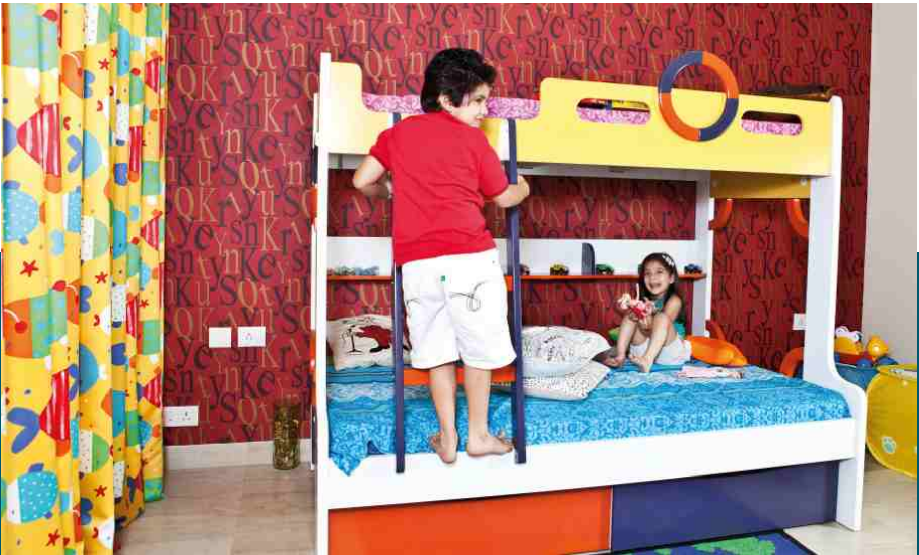
Actual Sample Flat