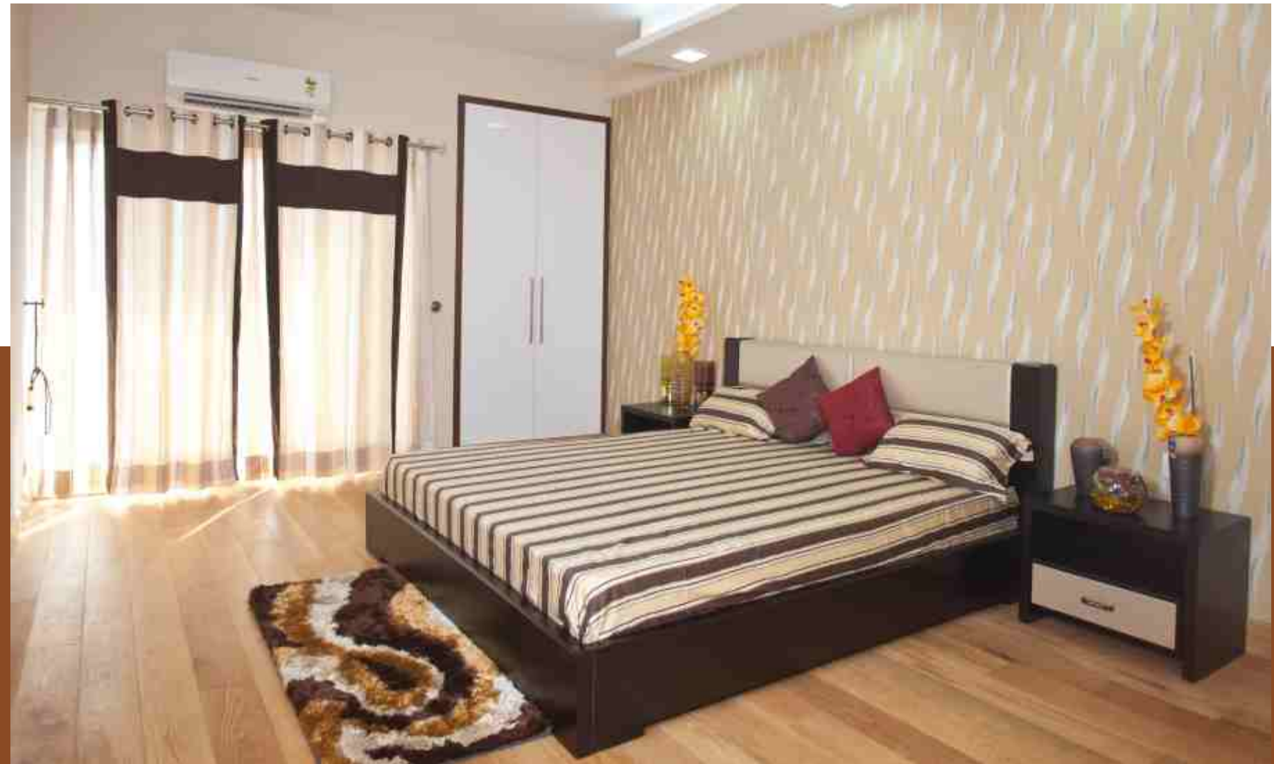
Actual Sample Flat

Blessed is the man who doesn't lose himself to the trap of worldly ostentations. Who won't renounce his honour for vitreous pretensions. Such is the man of prestige. Panchsheel salutes those exemplary individuals with a possession that's as exclusive as their repute. Pratishtha. Because, those who choose to live with their head held high, deserve to live in an abode that commands a standing.