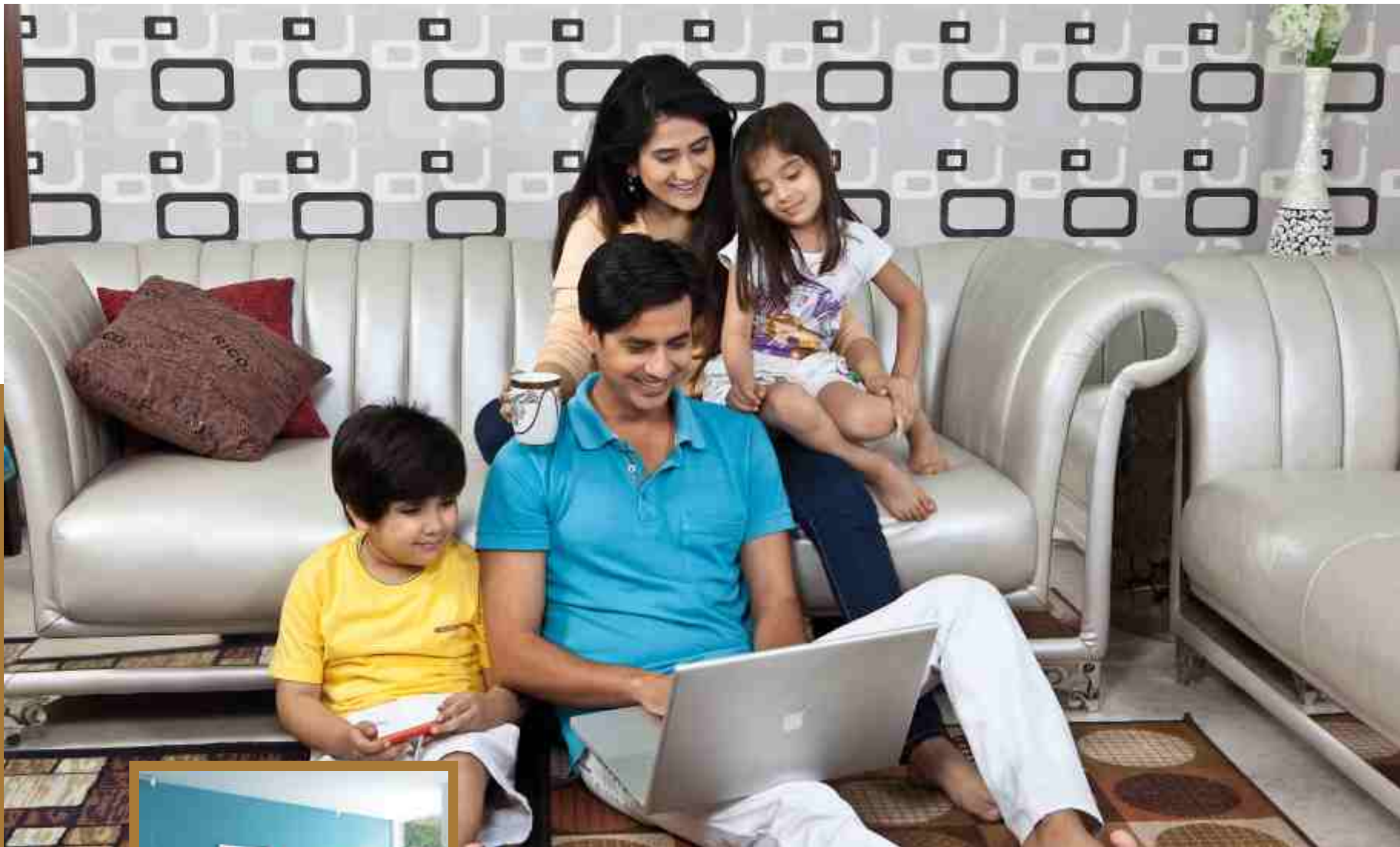
Actual Sample Flat