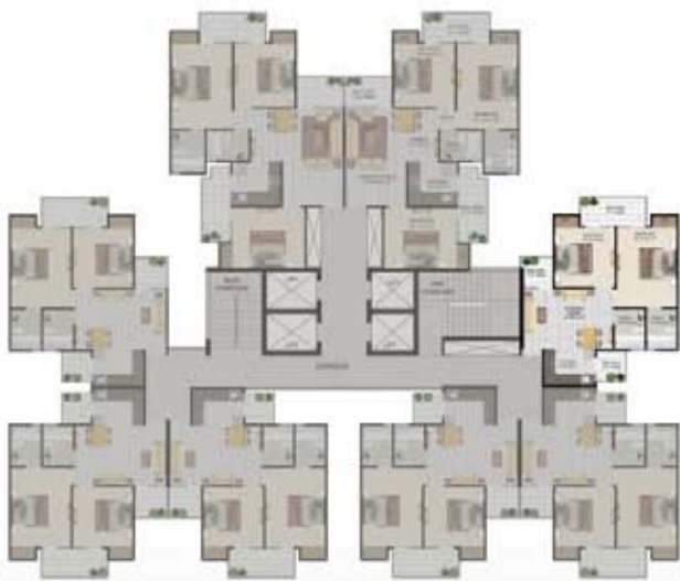
TOWER-F1 & F3 (Unit No. 3 to 8)

Area-975 SQ FT 2 Bedrooms Drawing/Dining Kitchen 2 Toilets 3 Balconies