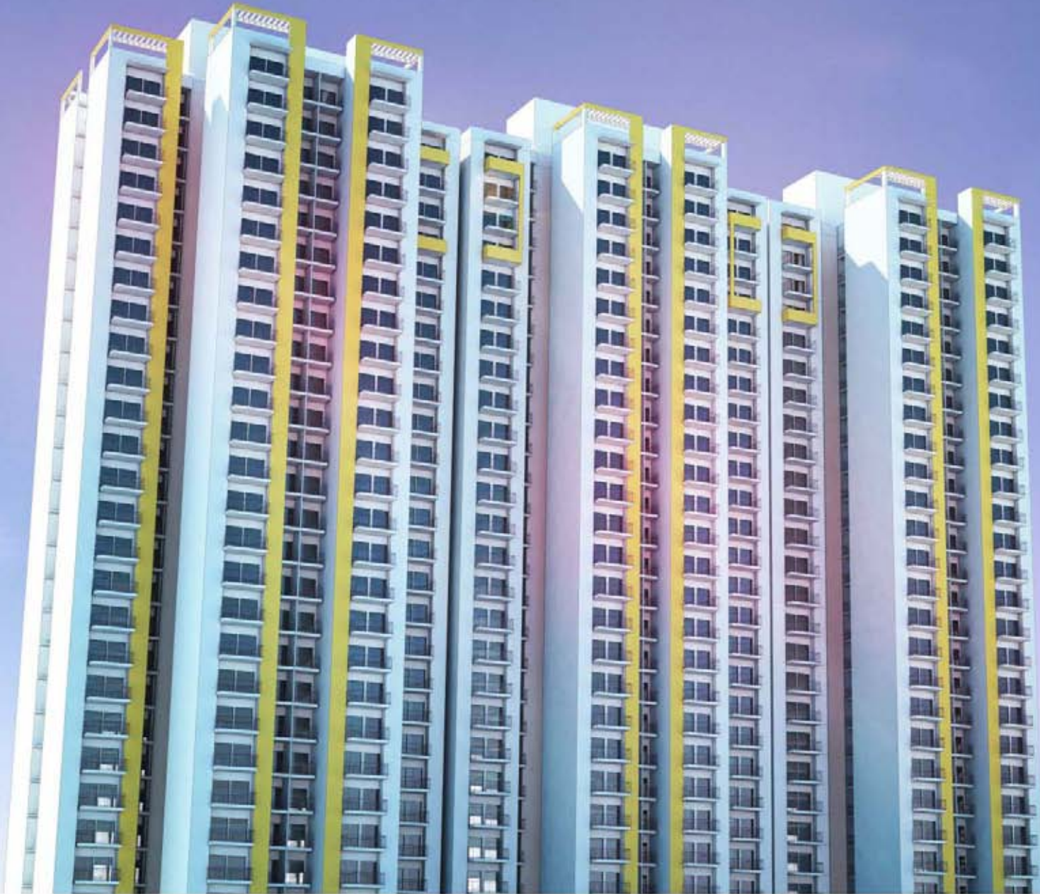
Artistic view only for reference