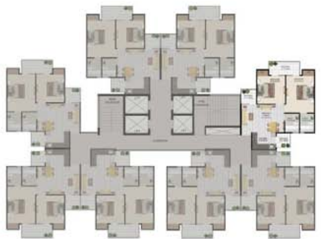
TOWER- F2 (Unit No. 1 to 8)