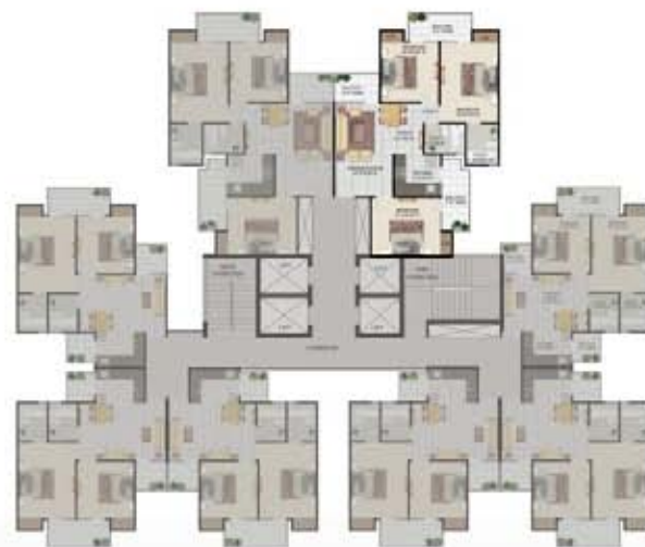
TOWER-F1 & F3 (Unit No. 1 & 2)