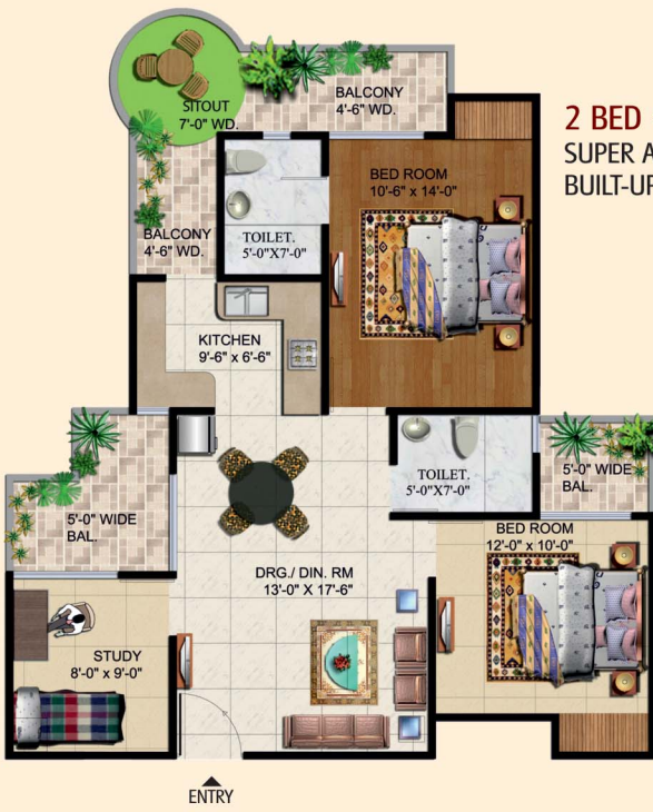
2 BED + 2 TOILETS + STUDY SUPER AREA = 1230 SQ. FT. BUILT-UP AREA = 984 SQ. FT.