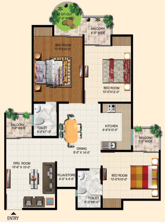
3 BED + 2 TOILETS + PUJA/STORE SUPER AREA = 1395 SQ. FT. BUILT-UP AREA = 1088 SQ. FT.