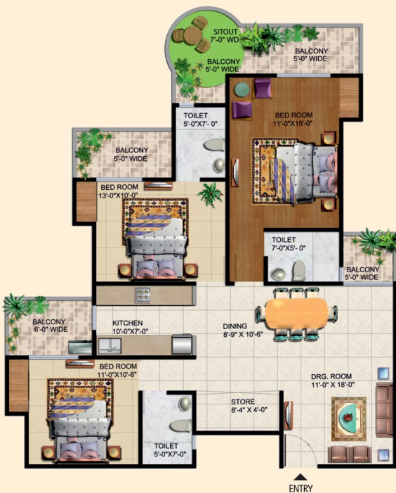
3 BED + 3 TOILETS + STORE SUPER AREA = 1665 SQ. FT. BUILT-UP AREA = 1325 SQ. FT.