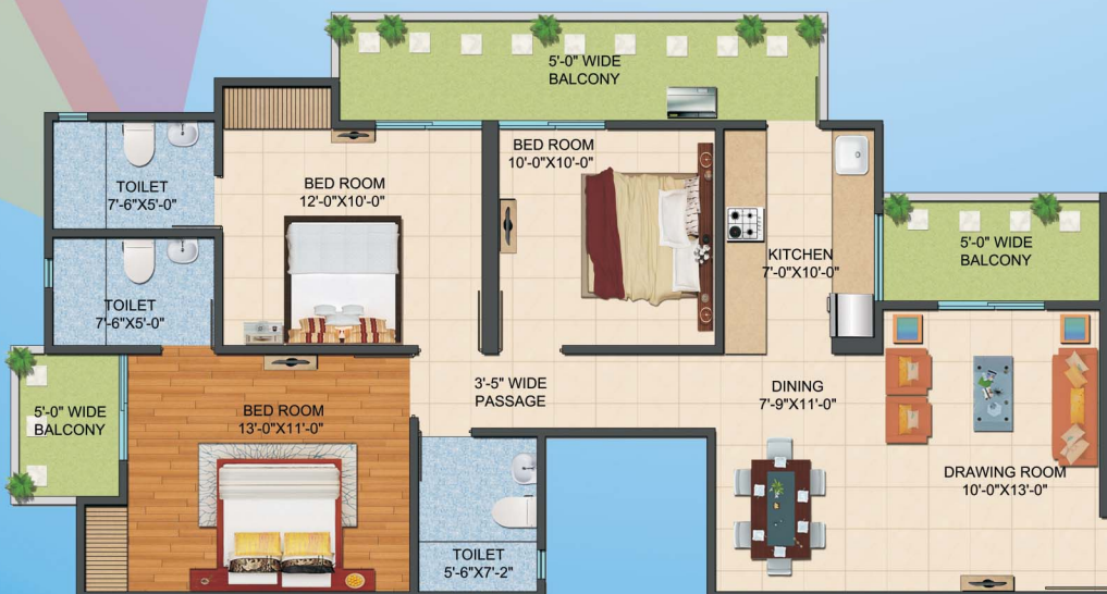
Tower-D, G Unit Plan Super Area= 1500 Sq.ft. 3 Bedroom Drawing/Dining 3 Toilet Kitchen Balcony