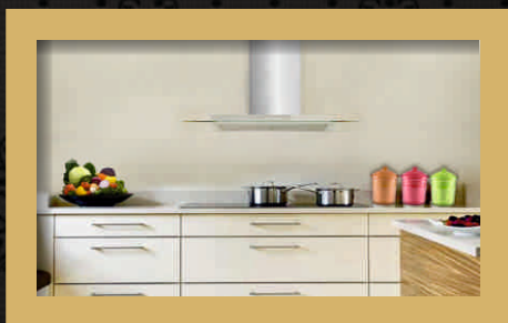
Modular type Kitchen with chimney & hob