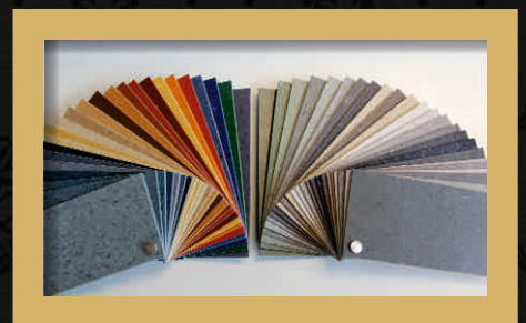
Choice of Wall colours

Crafted to perfection, for the discerning few.